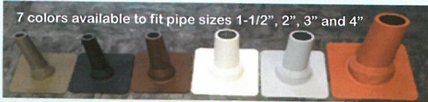
7 colors available to fit pipe sizes 1-1/2", 2", 3" and 4"